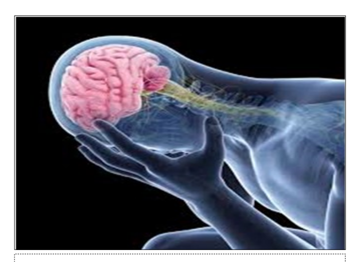
Figure 2. Brain fatigue