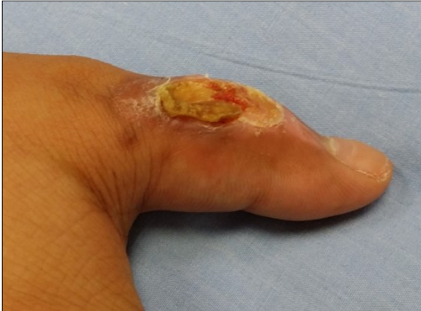
Figure 17. 6 weeks post-op