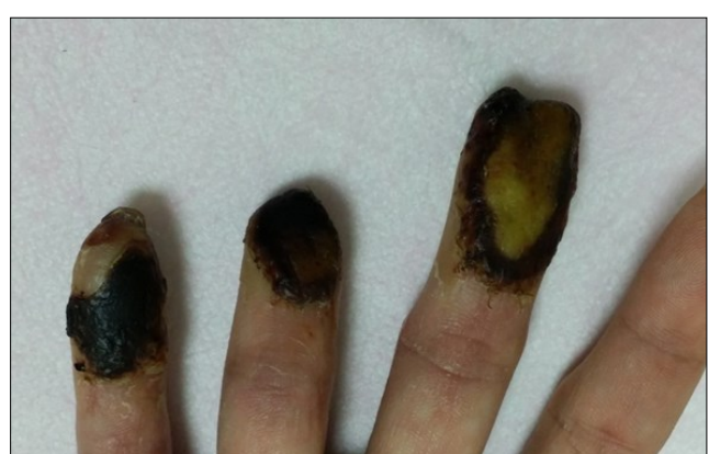
Figure 24. 2 months post-op