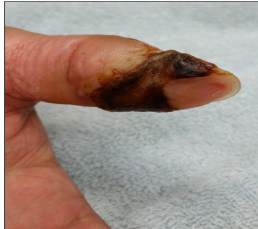
Figure 11. 2 months post-op