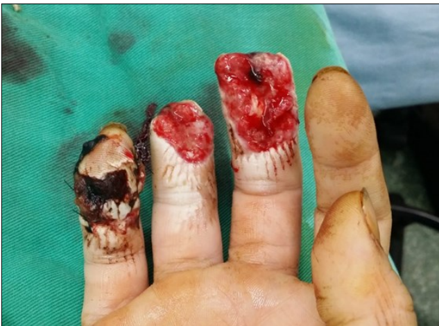
Figure 22. 8 days post-op

Case 7. 40 y/o female. Crush injury of the right hand; amputation of right middle finger through DIPJ with volar oblique defect; amputation of right finger through middle phalanx with volar oblique defect; bone exposure. (Figure 22-25).