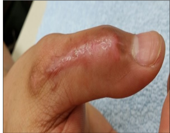
Figure 18. 10 weeks post-op

Case 6. 54 y/o male. Chemical burn, full thickness burn wound of right middle finger; tendon exposure. (Figure 19-21).