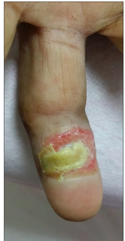
Figure 20. 2 months post-op