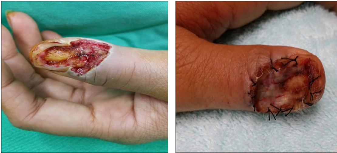
Figure 14. 4 days post-op

Case 4. 44 y/o female. Laceration wound of the left thumb; dorsal oblique soft defect; nail bed defect. Over DIPJ with bone and joint exposure. (Figure 14-15).