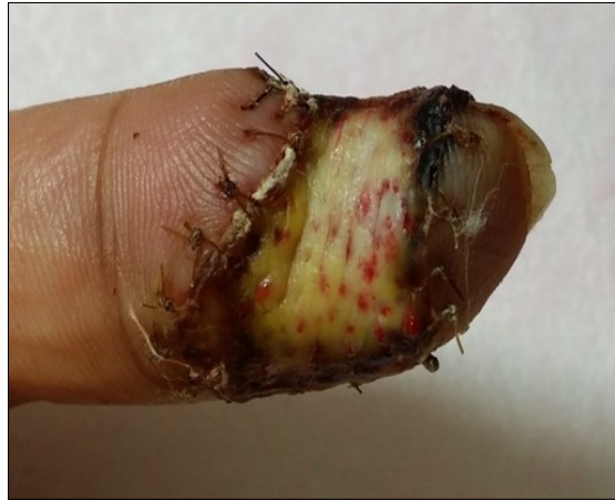
Figure 10. 15 days post-op