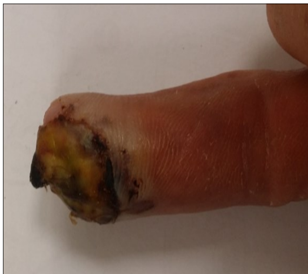
Figure 3. 2 wks postr-o