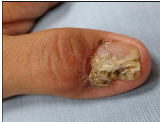
Figure 15. 3 months post-op

Case 5. 24 y/o male. Contact full thickness burn wound of right thumb; soft tissue defect of dorsal side of the IPJ; tendon exposure. (Figure 16-18)