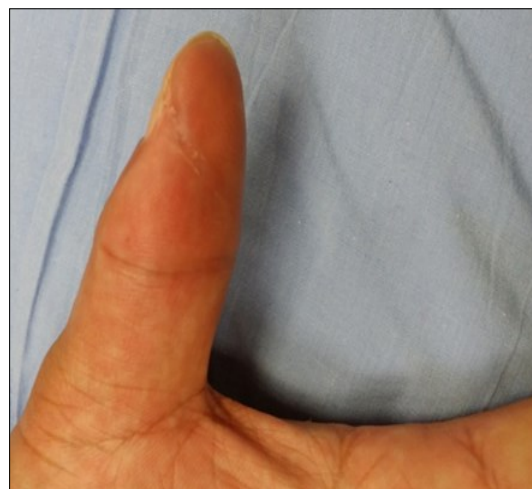
Figure 13. 4 months post-op