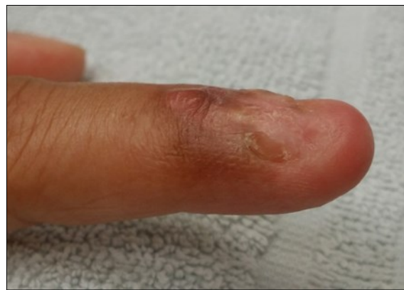
Figure 8. 11 wks post-op