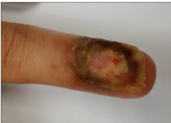
Figure 7. 8 wks post-op