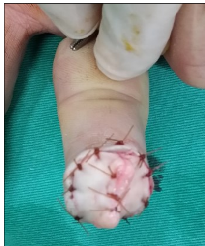
Figure 1. Post-op