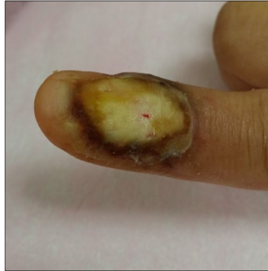
Figure 6. 4 wks post-op