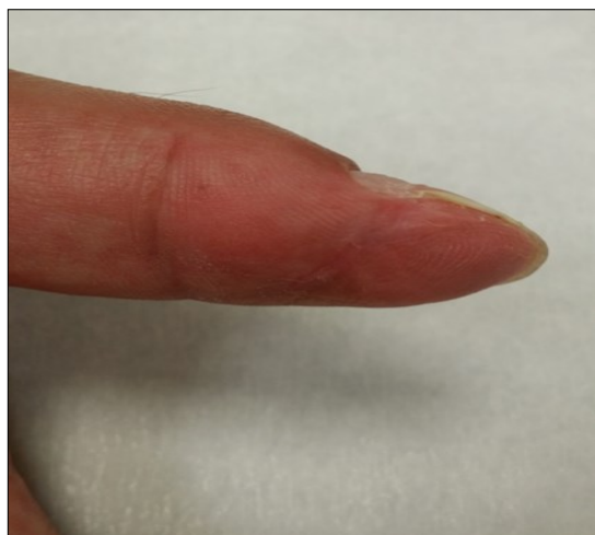
Figure 12. 3 months post-op