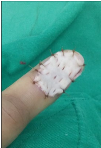
Figure 5. Post-op