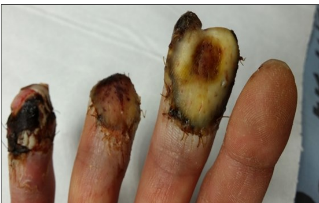
Figure 23. 2 weeks post-op