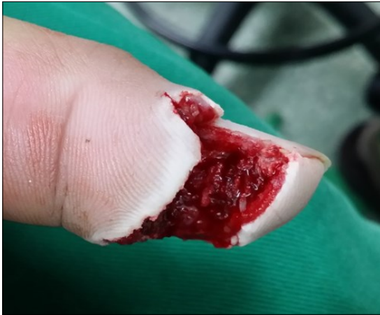
Figure 9. 4 days post-op

Case no 3. 42 y/o, male. Crush injury with soft tissue defect of volar side of the left thumb. (Figure 9-13).