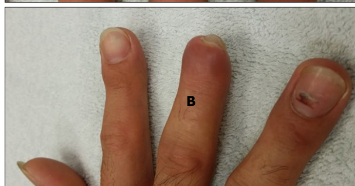
Figure 4. a-b: 4 wks post-op