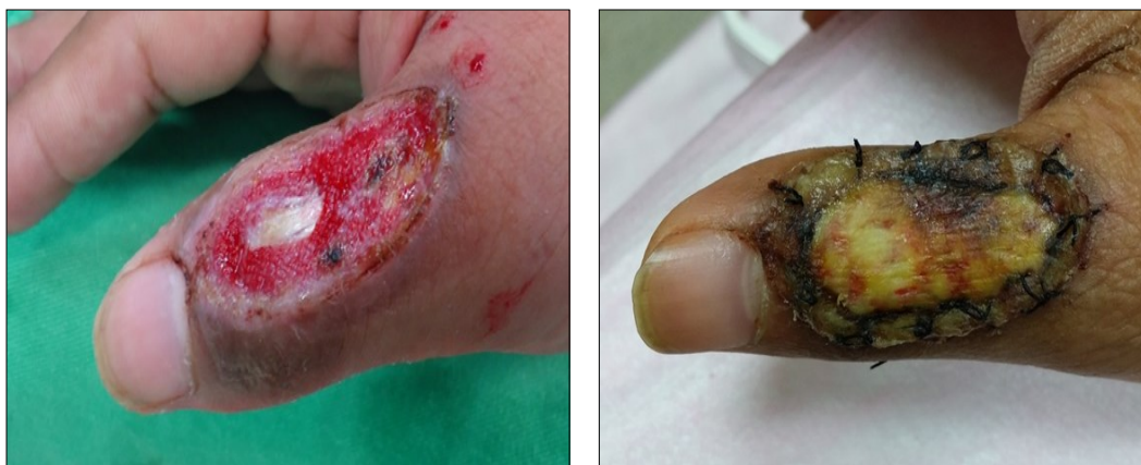
Figure 16. 2 weeks post-op

Case 5. 24 y/o male. Contact full thickness burn wound of right thumb; soft tissue defect of dorsal side of the IPJ; tendon exposure. (Figure 16-18)