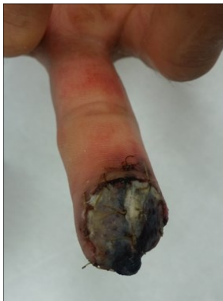
Figure 2. 4 days post-op