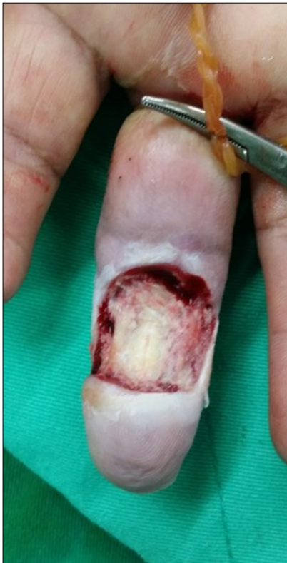
Figure 19. 8 days post-op

Case 6. 54 y/o male. Chemical burn, full thickness burn wound of right middle finger; tendon exposure. (Figure 19-21).