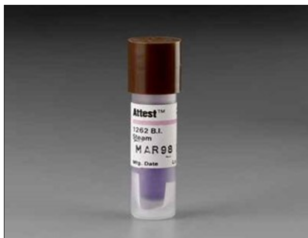
Figure 3. The used biological indicator.