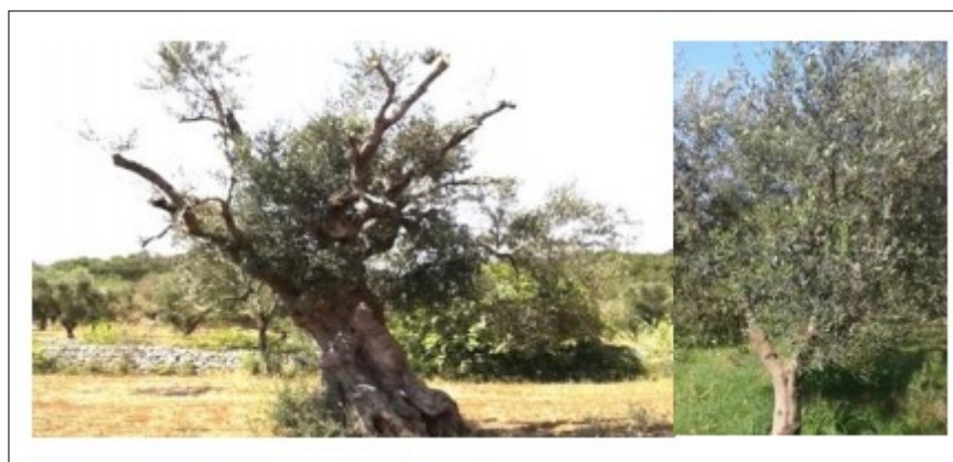
Figure 3. (left) Old olive tree heavily compromised which, after the first cycle of treatments with microbial consortia, has shown a clearly improved resilience and re-vegetation – (right) Younger tree showing and improved resilience to decline after pruning and treatment with consortia containing mycorrhizal fungi and bacteria (see also https://youtu.be/AXdbb4xrImQ ).

have a certain contrast activity against endo-pathogens. Several other different experimentations on the use of microbial consortia on main crops, such as tomato, potato and mais [71] [72] [73], lead to the same assumptions, indicating that the role of a certain microbial consortium is firstly the recovering of the soil vitality, as well as the presence of endophytic strains for contrasting biotic stressors. Beneficial effects were noticed also using a mixture of copper and zinc to form a hydroxyacidic complex with citric acid [74].