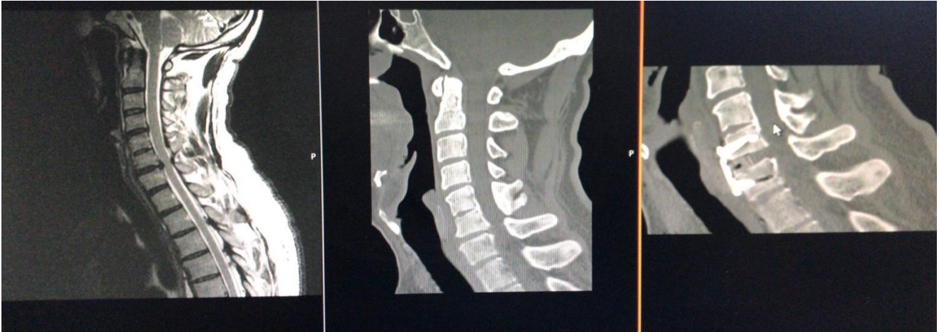
Figure 2. Computerized tomography, and magnetic resonance imaging views of a Yilmaz-Yucesoy Classification System Grade 3 patient who underwent anterior cervical discectomy and fusion with cervical cage and plate.