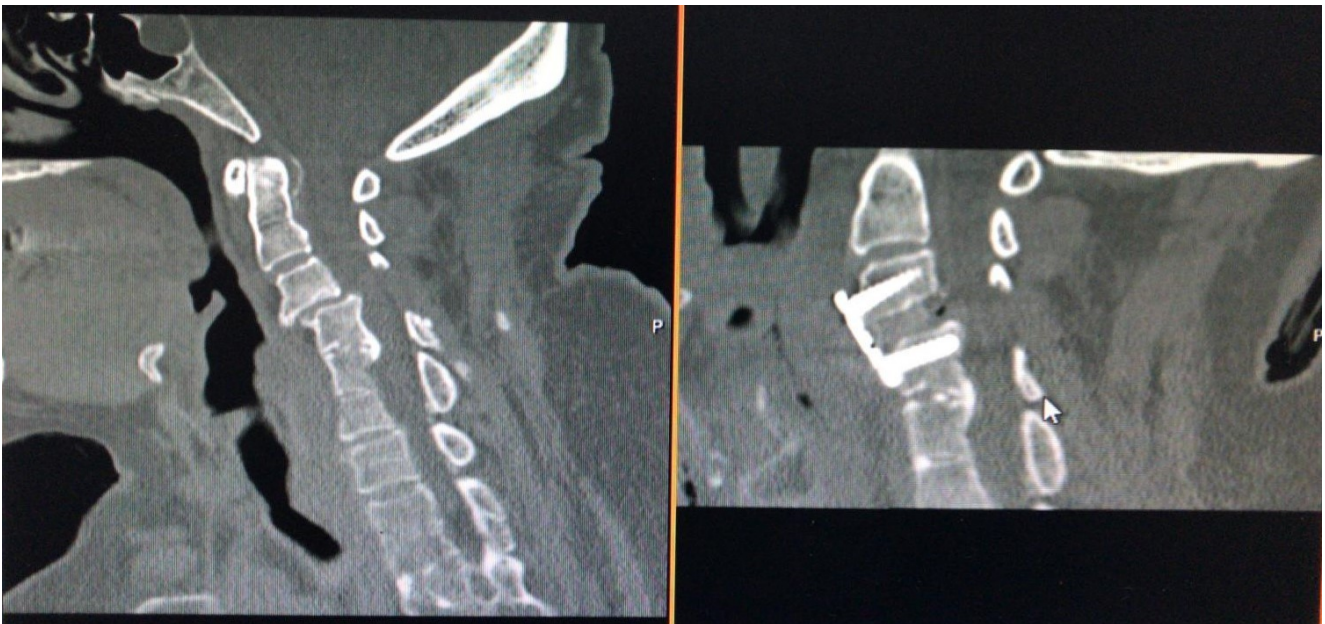
Figure 3. Computerized tomography scans of a Yilmaz-Yucesoy Classification System Grade 4 patient who underwent anterior cervical discectomy and fusion with cervical cage and plate.