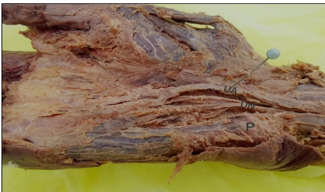
Figure 1. Photograph of the right-hand showing trifurcation pattern of the ulnar nerve UA, ulnar artery; UN, ulnar nerve; P, pisiform bone.

After the ulnar nerve was identified in the right hand, it was traced to the left hand. The branching pattern was the bifurcation pattern as it branched into two terminal branches; the superficial sensory branch and the deep motor branch. Fig (3)