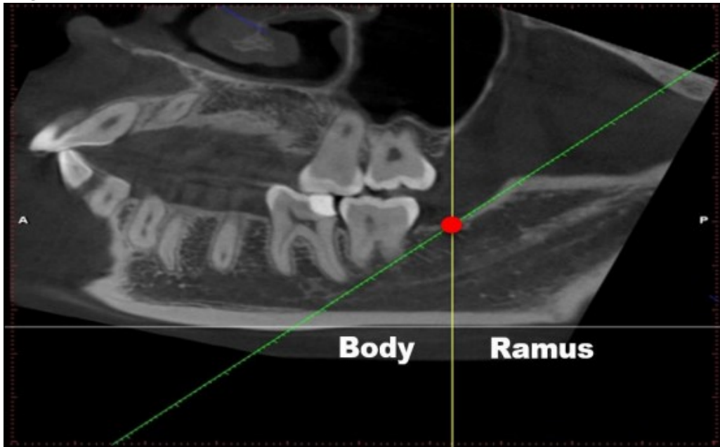
Figure 1. Image-reading position. (1) a horizontal line was made parallel to the lower edge of the mandible (grey line); (2) a tangent line of the front edge of the mandibular ramus (green line), which intersects with the upper edge of the mandibular body (Fig. 1, red circle); (3) a line across the intersection was made vertical to the line in (1) (Fig. 1, yellow line). We defined the following: the bifurcation that appears in front of this vertical line (yellow line) is classified into mandibular body area, whereas the bifurcation that appears behind it is the mandibular ramus area (Fig. 1).