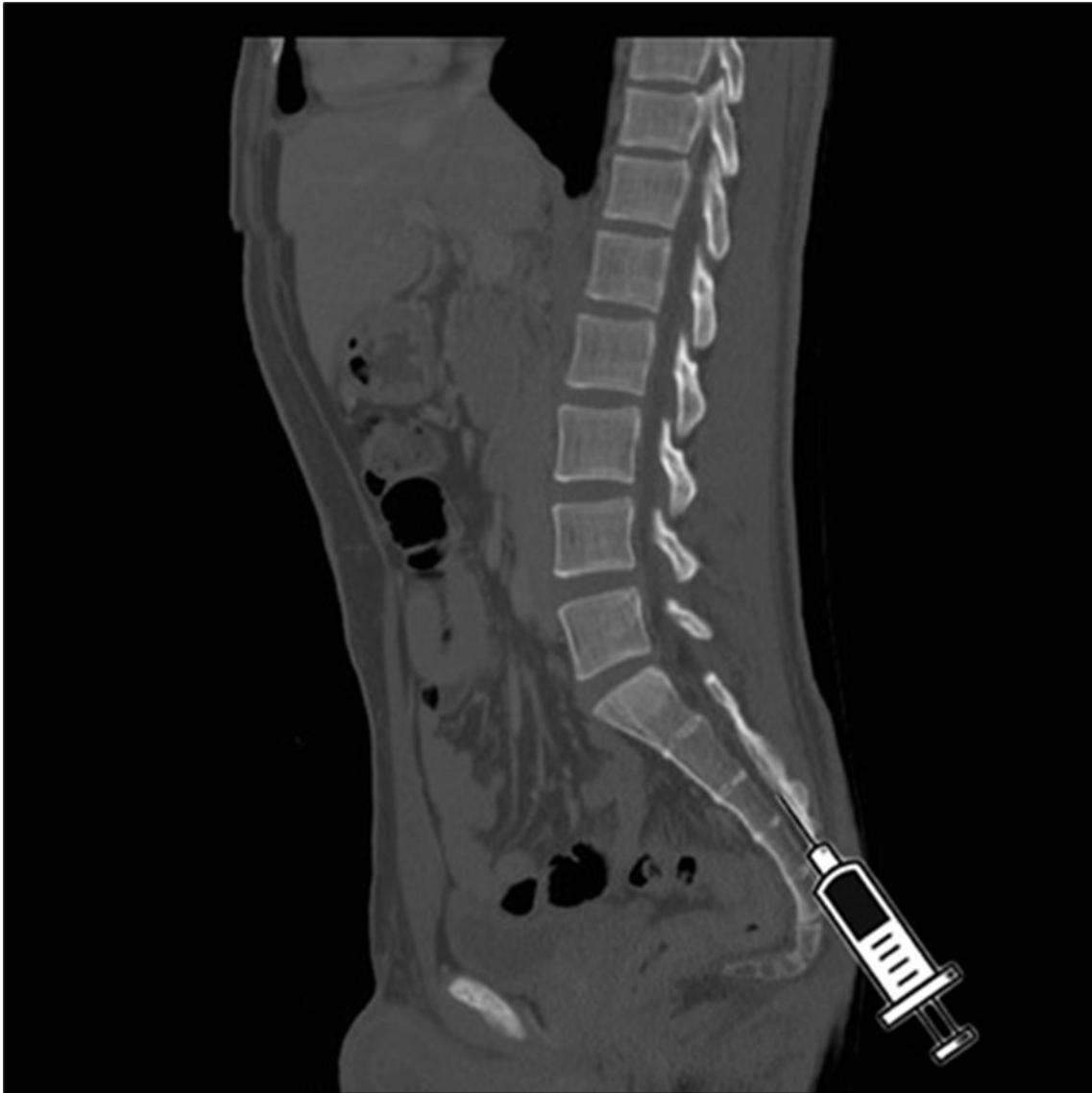
Figure 3. sagittal C.T. scan view of the injection in the hiatus.

additional injections or alternative treatments can be considered based on their specific needs and circumstances.