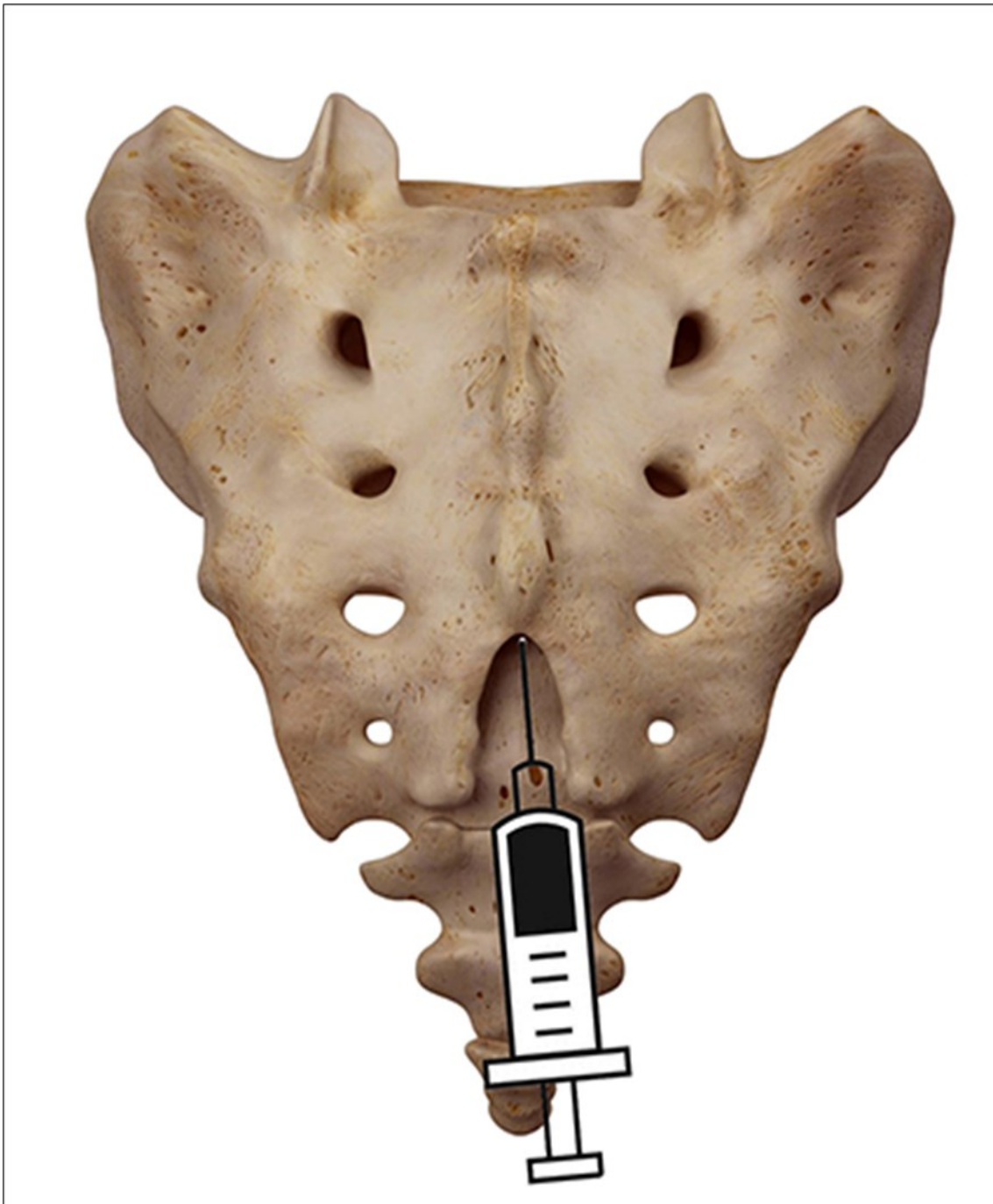
Figure 1. posterior view of the injection in the hiatus.

procedure. If lower back pain persists after a sacral injection, alternative treatment options should be discussed with a healthcare provider.