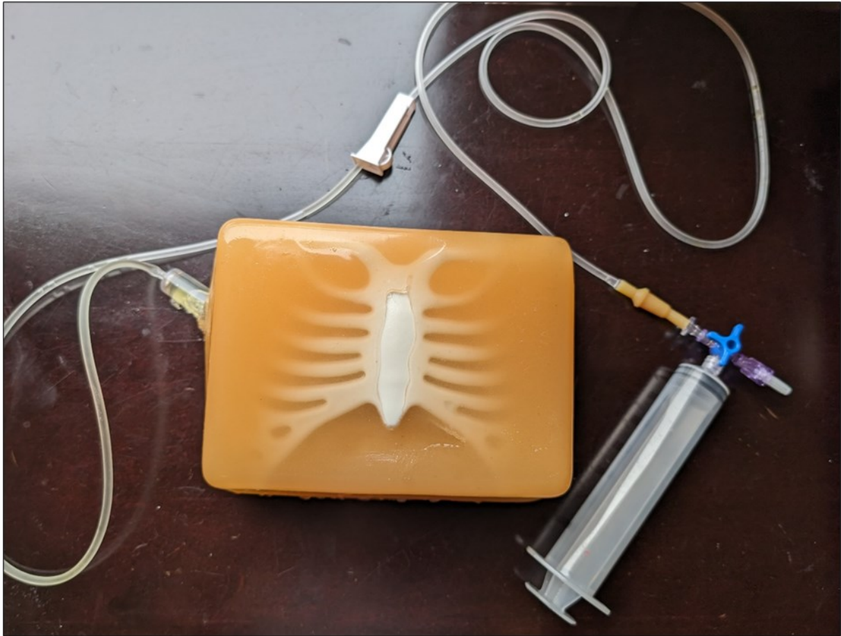
Picture 2. Showing the complete model of the neonatal pericardial effusion. We can see the spiked portion of the sailing bag coming out from the model. We can also see some yellow-colored fluid coming out in the tubing which represents the simulated pericardial effusion fluid. The red arrow shows a three-way stopcock that connects the tubing to a 50 ML syringe. This syringe will be used to refill the saline bag simulating the pericardial effusion once the fluid is decreasing after it's drained by the trainee