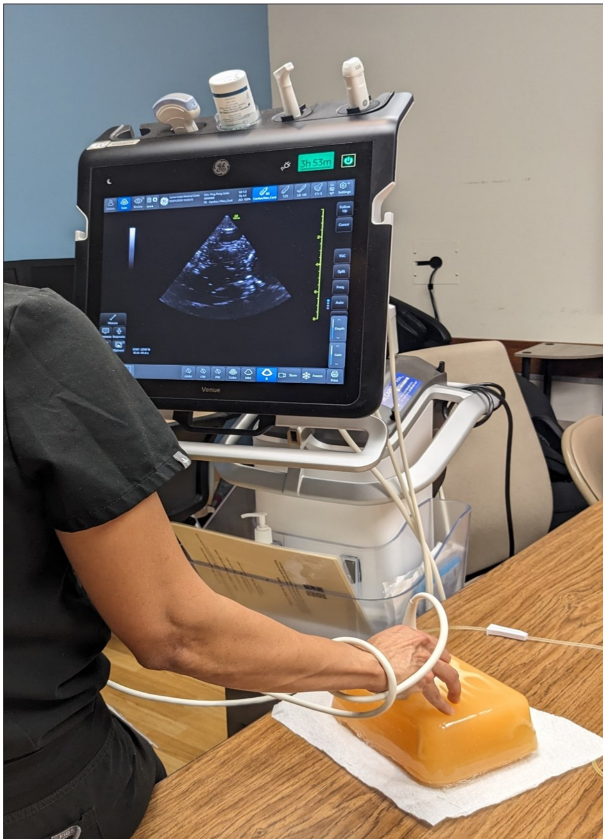
Picture 1. The red arrow indicates the right ventricle and the green arrow indicates the pericardial effusion note that the fusion does not appear circumferential