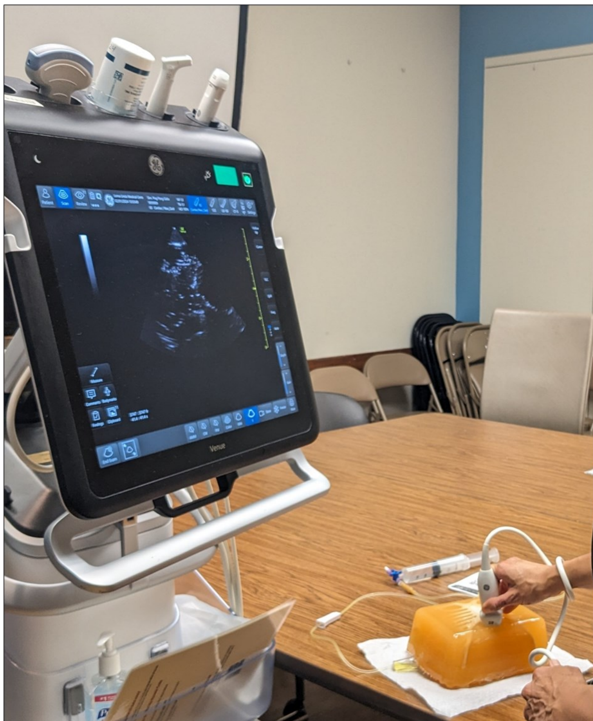
Picture 3. Showing the pericardial effusion from the subcostal view under ultrasound guidance