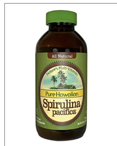
Fig. 3 Different Spirulina brands by Companies [142, 144, 143]

Far East Bio-Tec Co., Ltd. (ALGAPHARMA BIOTECH CORP.) is a Taiwan supplier and manufacturer of organic spirulina, organic chlorella and biotech microalgae research market. FEBICO has been offering customers various high value spirulina, chlorella, organic chlorella, bio chlorella and blue green algae since 1976.