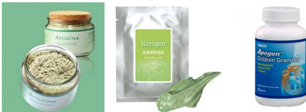
Fig. 4 Different commercial products from algae by FEBICO Ltd. [146]

Astaxanthin (AstaReal®): Haemotococcus pluvialis Microalgae Extract.