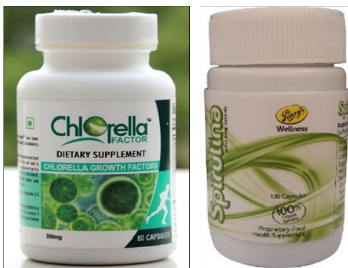
Fig. 6 Commercialized Chlorella tablets from different companies [152]

-India based food company with specialization in harvesting, production and marketing of Spirulina .