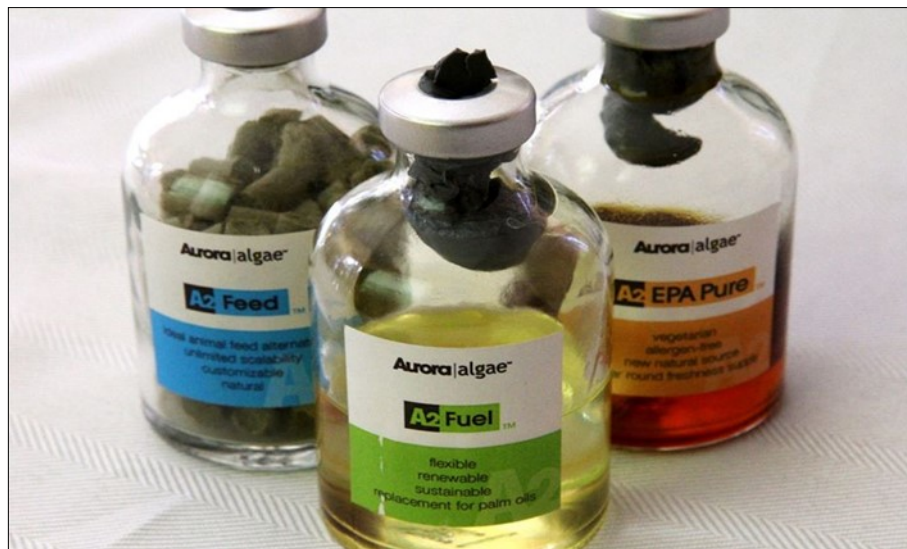
Fig. 2 The finished products. Protein pellets on the left, bio-diesel in the middle and omega 3 oil on the right.(Aurora algae) [141]