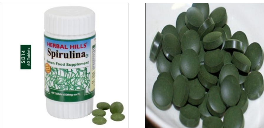
Fig 5. Commercialized Spirulina tablets of different companies [150, 154]

Pondicherry Spirulina Farms (PyFarms): were established in May 2008, having a license to commercially grow the algae Spirulina as health food in the Union Territory of Pondicherry, India. This is a South