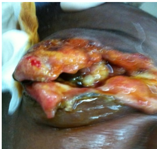
Figure 2: Invasive form of squamous cell carcinoma with exophthalmos