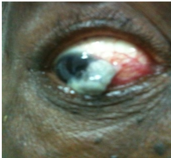
Figure 1 Localized form of conjunctival squamous cell carcinoma